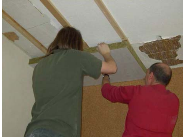
Figure 3: Replacing parts of the ceiling of a classroom by students themselves